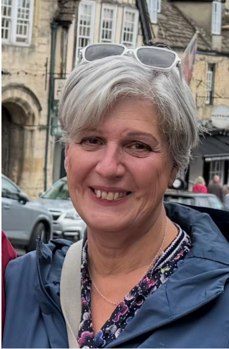
Meet our new Vice-Chair